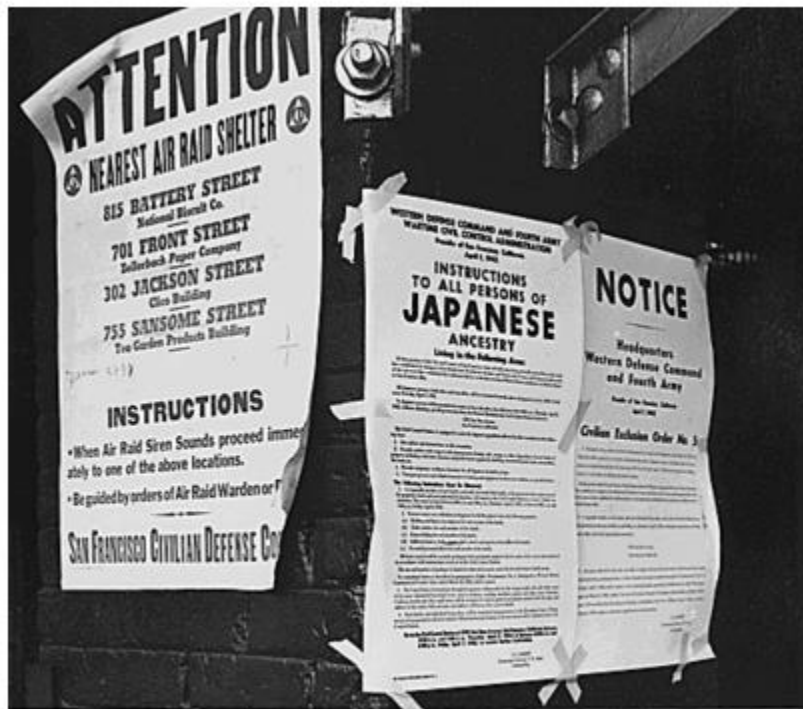
Posted on the wall of a San Francisco air raid shelter in 1942, this notice ordered people of Japanese ancestry to report for evacuation within one week.

Although more than 60 percent of those ordered to evacuate were U.S. citizens, none had a hearing or trial before the government locked them up in relocation camps. Once in the camps, however, the government asked them to sign a loyalty oath to the United States. Most did, but about 4 percent refused, protesting how they had been treated. The government classified these individuals as "disloyal."