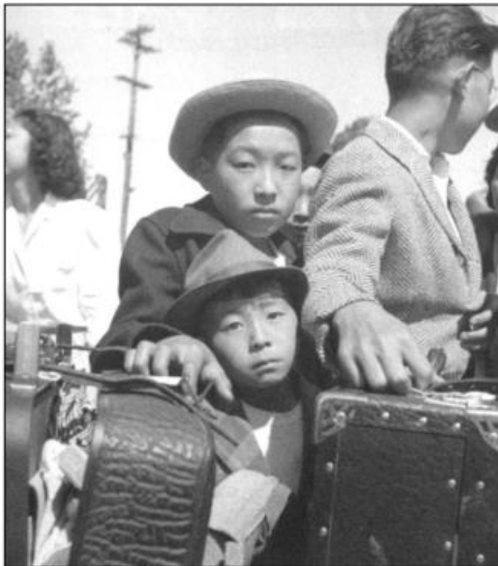
Two boys huddle with their family waiting for a train to take them to a relocation center.

The Issei met a lot of official racial discrimination. Federal law prohibited the Issei from ever becoming naturalized U.S. citizens. California, where most of the Issei lived, made it illegal for them to own agricultural land. In 1924, the federal government placed a ban on all Japanese immigration.